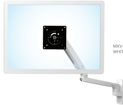
MXV WALL MONITOR ARM WHITE